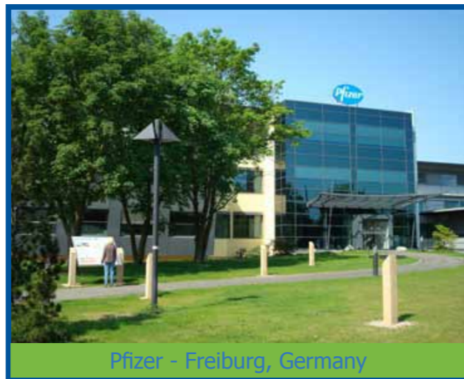
Pfizer - Freiburg, Germany

The trial was run over three days at the Pfizer plant in Freiburg Germany with I Holland present throughout the trial working alongside the PPD team to monitor and analyse the results. Every tablet produced was isolated from each individual station using the capabilities of the press.