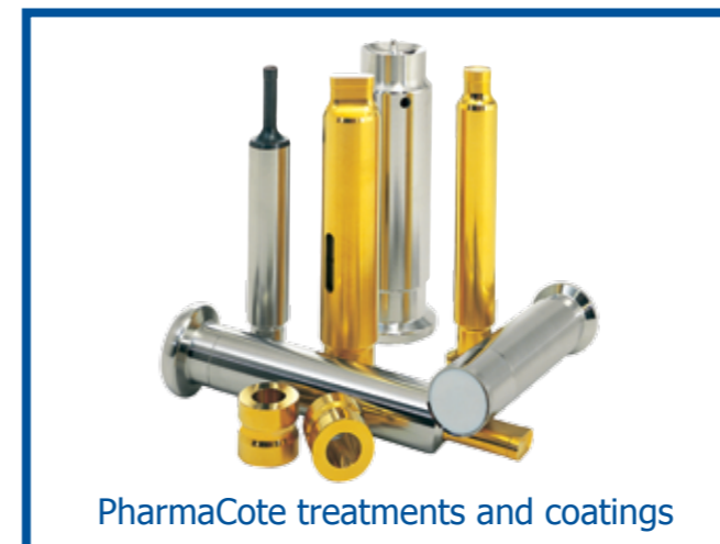
PharmaCote treatments and coatings